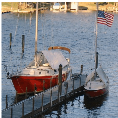
Segel and Pot of Gold winterized